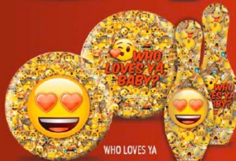
WHO LOVES YA